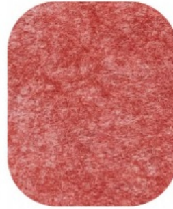
AM-43 Watermelon Red