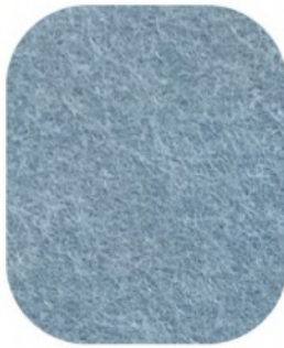
AM-50 Cyan Blue