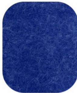
AM-41 AM Blue