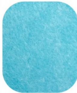
AM-30 Tiffany Blue