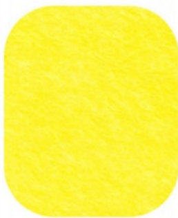
AM-09 Lemon Yellow