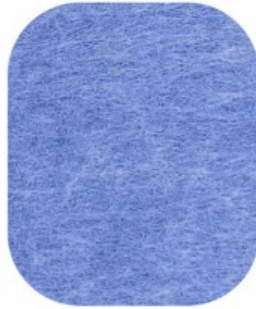
AM-27 Sky Blue