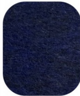
AM-31 Starry Sky Blue