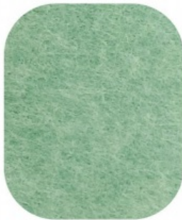
AM-29 Turquoise Green