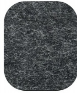
AM-36 Sesame Black