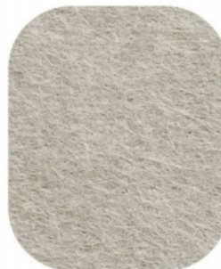
AM-07 Pure Camel