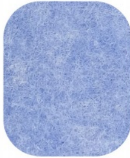
AM-26 Light Sky Blue