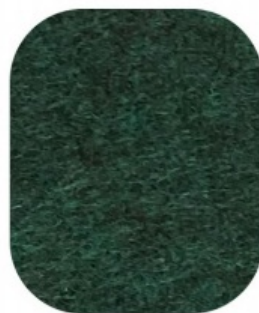
AM-20 Dark Green