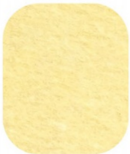
AM-14 Light Yellow