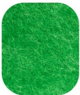
AM-18 Emerald Green