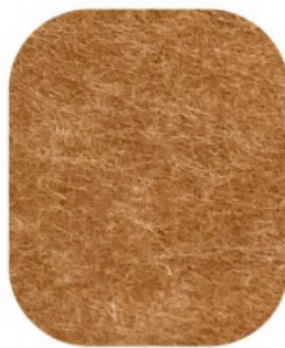
AM-11 Milk Coffee