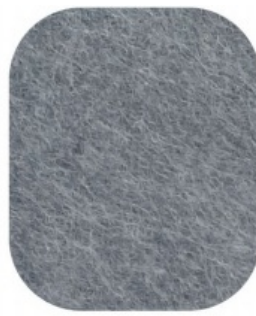
AM-23 Moonlight Gray