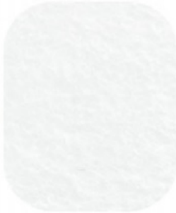
AM-02 Porcelain White