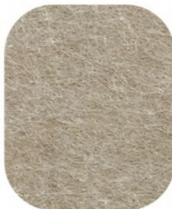
AM-06 Deep Camel