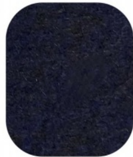
AM-32 Dark Blue