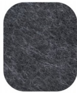
AM-24 Dark Gray