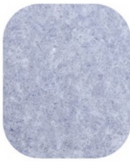
AM-21 Smoke Gray