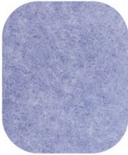
AM-25 Water Gray