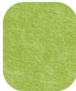
AM-16 Plum Green