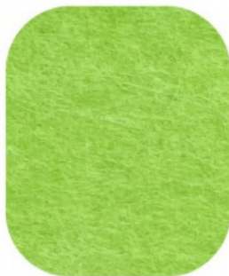
AM-15 Fruit Green