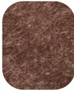
AM-34 Red Coffee