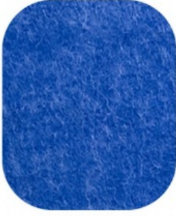
AM-49 BMW Blue