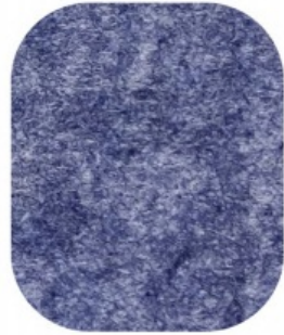
AM-28 Sea Blue