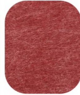
AM-44 Dark Red