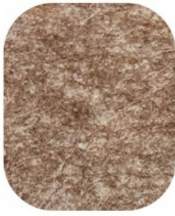
AM-33 Dark Brown