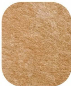
AM-05 Longan Yellow