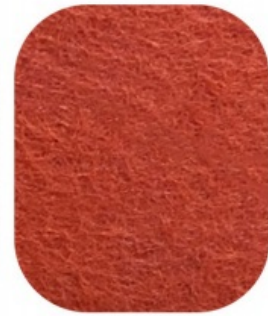
AM-52 Havana Orange