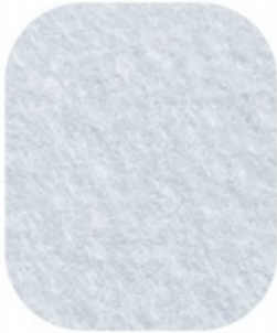
AM-01 Snow White