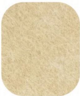
AM-13 Light Coffee