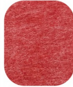
AM-40 Begonia Red