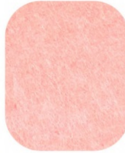
AM-39 Flesh Pink