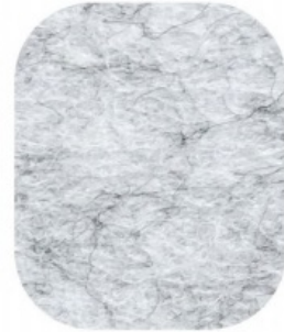
AM-04 Silver Gray