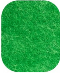
AM-18 Emerald Green