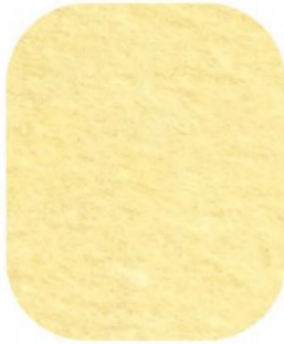
AM-14 Light Yellow