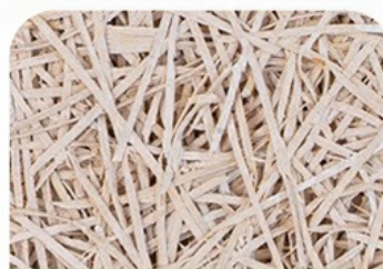
■ 2.0mm fiber width