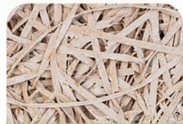
■ 3mm fiber width