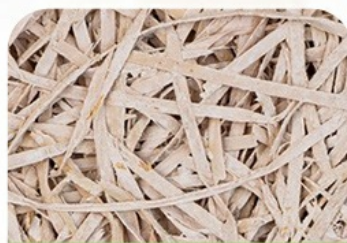
■ 3mm fiber width