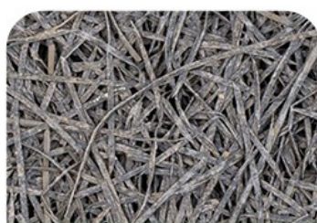
■ 1.5mm fiber width