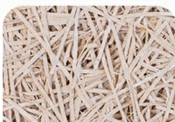
■ 2.0mm fiber width