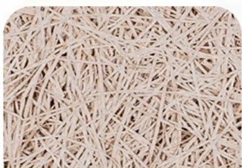
■ 1.0mm fiber width