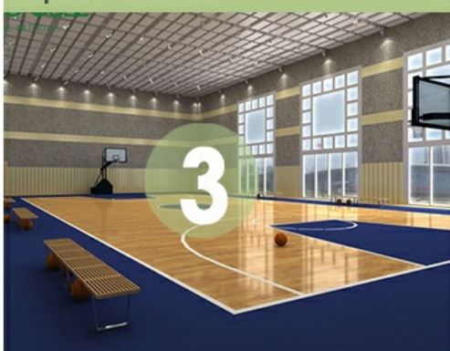
Good sound absorption performance