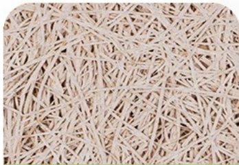
■ 1.0mm fiber width