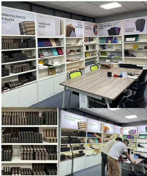
The exhibition hall

Magic Cube(MQ)Acoustics is a professional acoustic solution provider,integrating acoustic material manufacturing,architectural acoustical environment construction and industrial noise control.We are committed to the combination of Acoustics&Aesthetic,to offering our clients the best acoustic solution with high quality acoustic material.