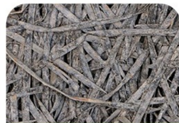
■ 3mm fiber width