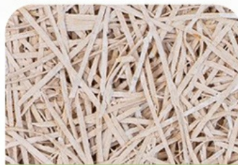
■ 2.0mm fiber width