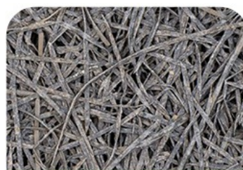
■ 1.5mm fiber width