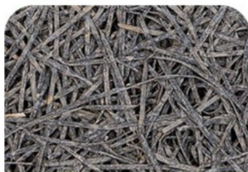
■ 1.0mm fiber width