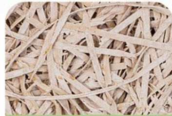
■ 3mm fiber width