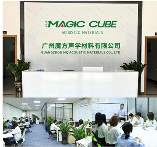
The exhibition hall

Magic Cube(MQ)Acoustics is a professional acoustic solution provider, integrating acoustic material manufacturing, architectural acoustical environment construction and industrial noise control. We are committed to the combination of Acoustics&Aesthetic, to offering our clients the best acoustic solution with high quality acoustic material.