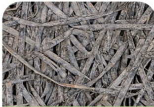
■ 3mm fiber width