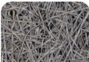
■ 1.5mm fiber width