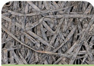
■ 3mm fiber width