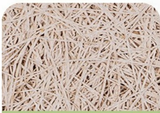
■ 1.0mm fiber width