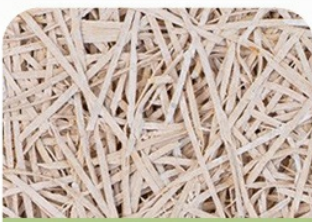
■ 2.0mm fiber width