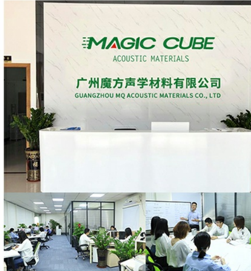
The exhibition hall

Magic Cube(MQ)Acoustics is a professional acoustic solution provider, integrating acoustic material manufacturing, architectural acoustical environment construction and industrial noise control. We are committed to the combination of Acoustics&Aesthetic, to offering our clients the best acoustic solution with high quality acoustic material.