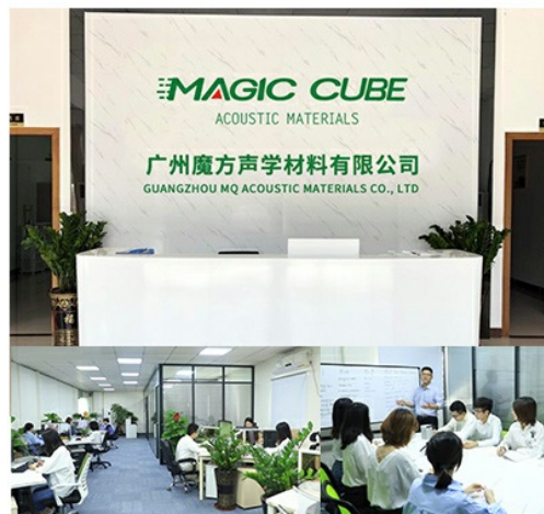
The exhibition hall

Magic Cube(MQ)Acoustics is a professional acoustic solution provider, integrating acoustic material manufacturing, architectural acoustical environment construction and industrial noise control. We are committed to the combination of Acoustics & Aesthetic, to offering our clients the best acoustic solution with high quality acoustic material.