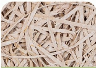
■ 3mm fiber width