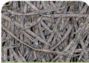
■ 3mm fiber width