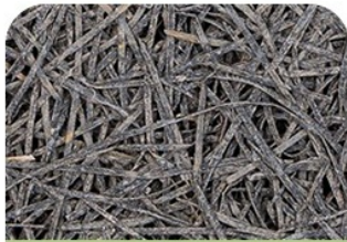
■ 1.0mm fiber width