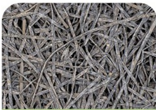
■ 1.5mm fiber width