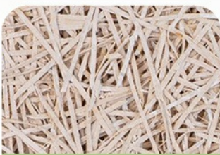
■ 2.0mm fiber width