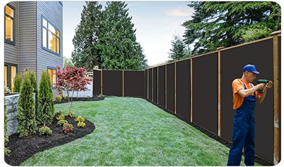
Shared fence line